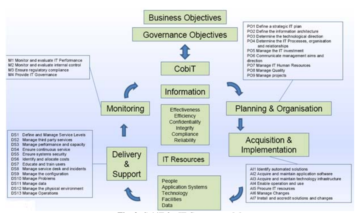
Fig. 2. CobiT for IT Governance [6]

Control objectives are defined in a general manner, independent from technical support, but it is accepted that some special technical environment can require a distinct approach of control objectives. Therefore, it have to be mentioned that objectives consists of statements on results or desired goals that should be reached through implementation of specific control procedures within IT activities.